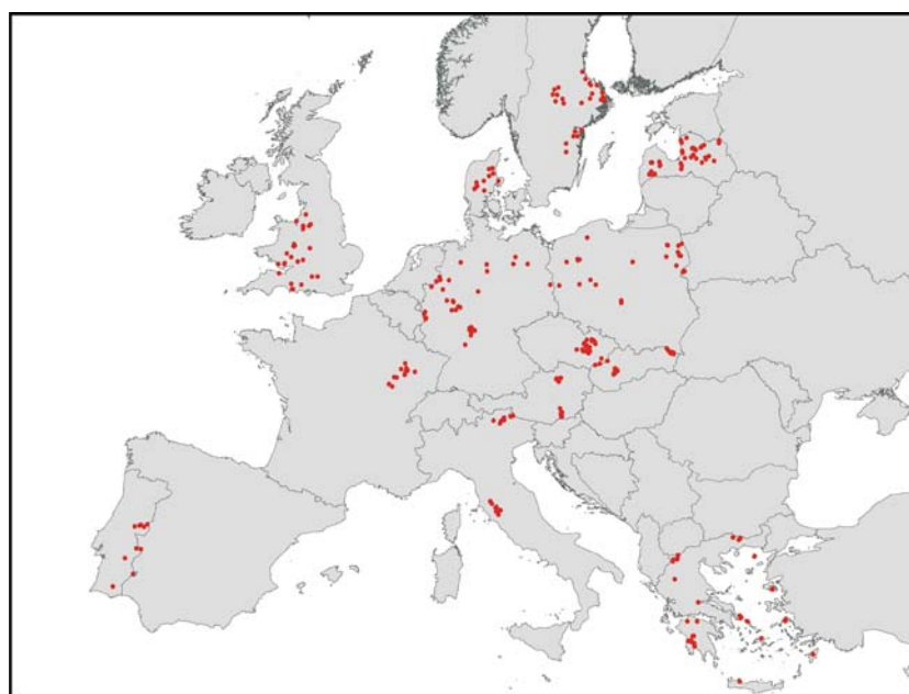
Figure 1. The location of the 263 sites sampled for macro-invertebrates.

Prior to starting field sampling and surveying, the study reach at each site was selected. The reach was 500 m long and was selected as representative of the hydromorphological conditions of the stretch of river under investigation. A stretch of river is a continuous section of river without any significant tributaries or point sources of pollution likely to modify its Chemical Status (equivalent to a 'water body' as defined by the WFD). The